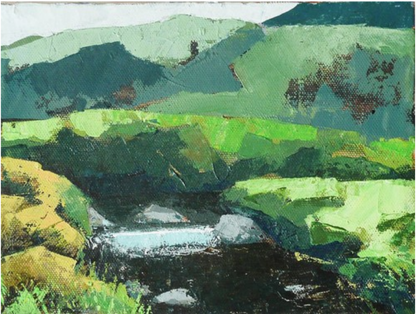
Burn in Glen Sannox